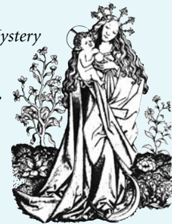
Mary, the first Steward of Christ