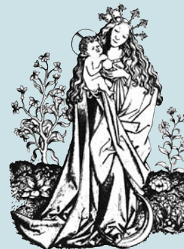
Mary, the first Steward of Christ